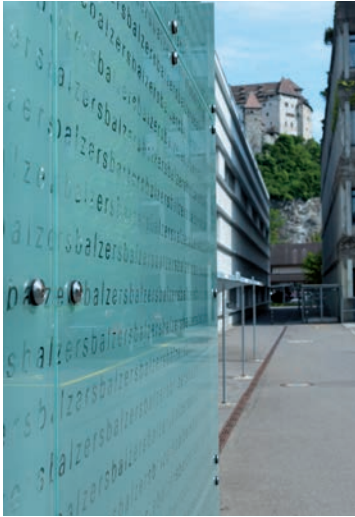
Solar installation on the Balzers Common, Oerlikon Balzers, Primary School (from left)